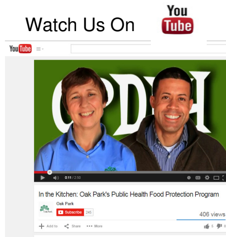
In The Kitchen: Oak Park's Public Health Food Protection Program (2013)