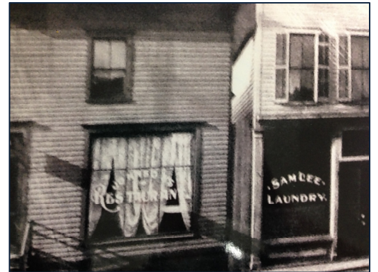
Johnson's Restaurant, Oak Park, Illinois