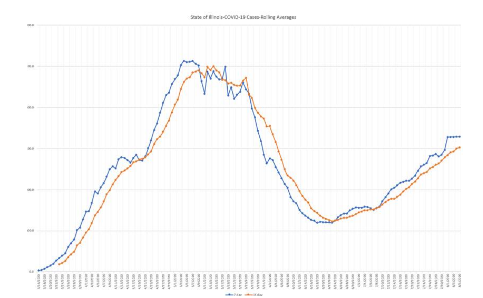
State of Illinois: 7 & 14 Day Rolling Averages: 7 day is 1,642 and 14 day 1,512