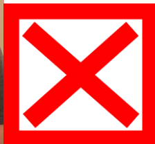
Figure 4 – This image demonstrates inappropriate wear of the procedure mask. Procedure mask should not be pulled under mouth