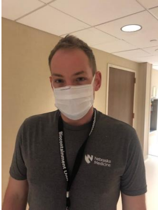
Figure 1 – This image demonstrates approved wear of face mask. Facemask is shown secured over nose and mouth.

The following images are intended to provide clarification to avoid potential errors in the proper use and re-use of face masks.