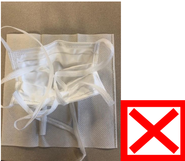
Figure 9 – This image demonstrates the wrong way to store surgical mask when not in use. Notice the exterior of the mask if facing up and ties are touching the interior of the mask. This is not correct