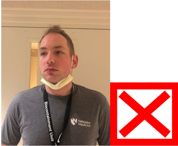
Figure 5 – This image demonstrates inappropriate wear of the procedure mask. Procedure mask should not be pulled under chin