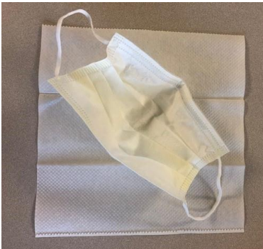
Figure 2 – This image shows the correct way to store mask when not in use. Notice the exterior of the mask is facing DOWN.