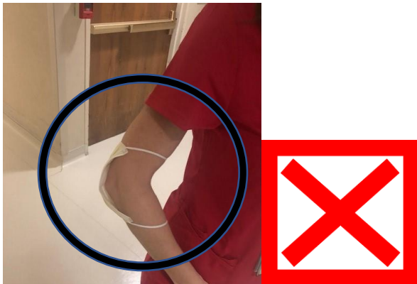
Figure 6 - This image demonstrates inappropriate use of procedure mask. Procedure mask should not be kept on the elbow when not in use