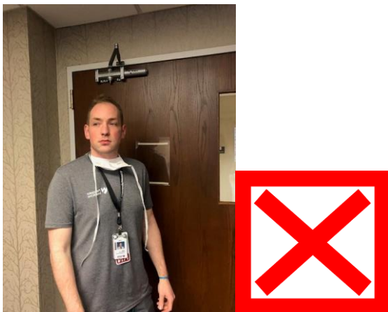
Figure 7 - This image demonstrates inappropriate wear of the surgical mask. Surgical mask should not hang from lower ties