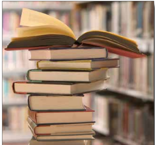
Contact any Oak Park Library for information on book sales, drives and other ways to recycle unwanted books.

Accepts clothing, books, music, shoes, furniture, small electronics and more. Pick-up available. Accepts donations during operating hours only.