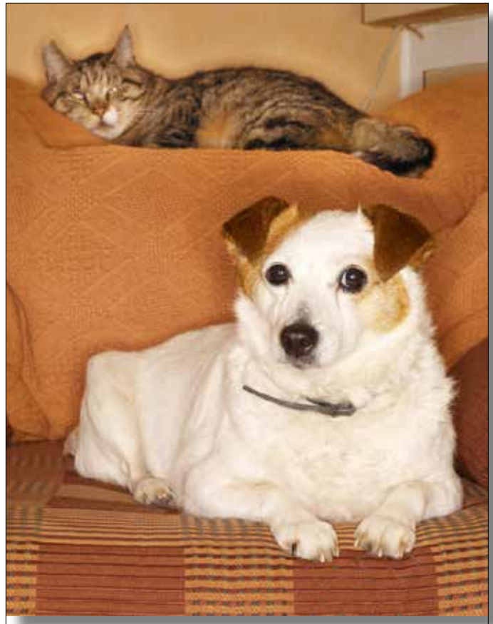
Oak Park's Animal Care League accepts new and used blankets for use with its many animals available for adoption.

Village of Oak Park Public Works Department 201 South Blvd., Oak Park 708.358.5700