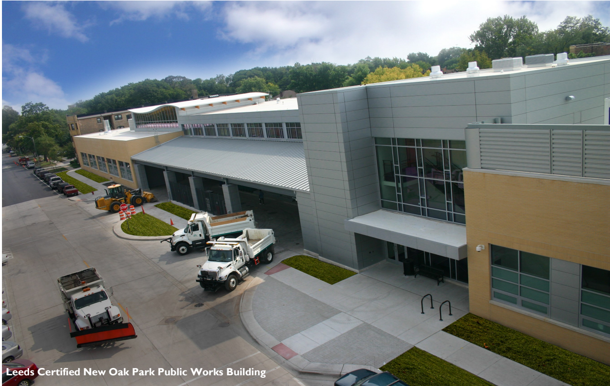
Leeds Certified New Oak Park Public Works Building