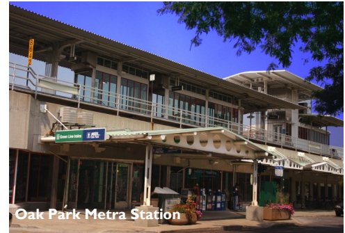
Oak Park Metra Station

Explain, justify and defend Law Department programs, policies,