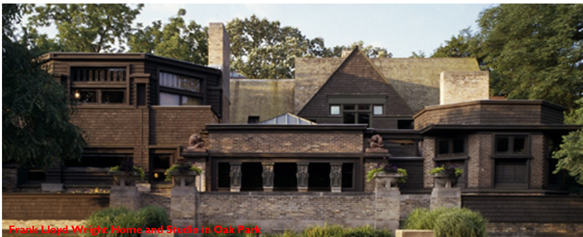
Frank Lloyd Wright Home and Studio in Oak Park