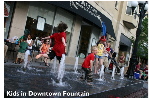
Kids in Downtown Fountain