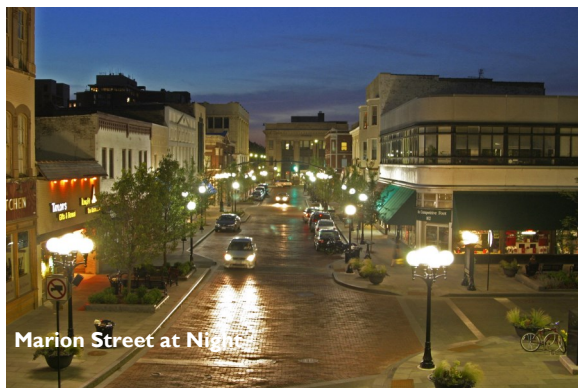
Marion Street at Night

This is a Village that appreciates art in so many forms and spreads it before you in so many ways. The world's largest concentration of Frank Lloyd Wright homes is joined by