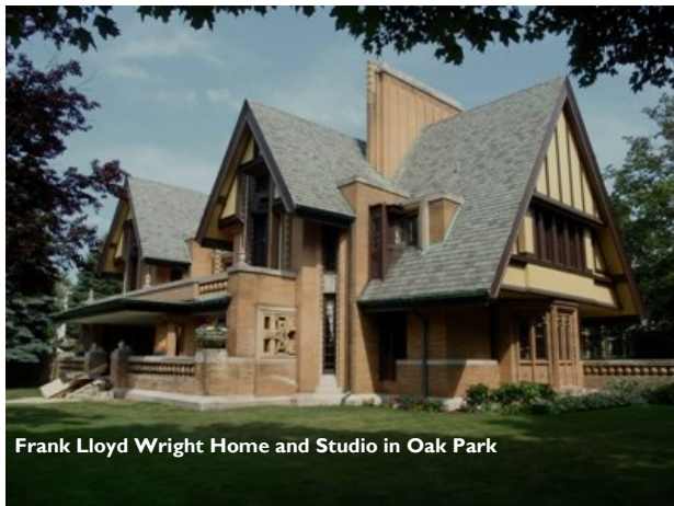
Frank Lloyd Wright Home and Studio in Oak Park

Work in an office environment; sustained posture in a seated position for prolonged periods of time.