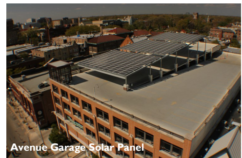
Avenue Garage Solar Panel