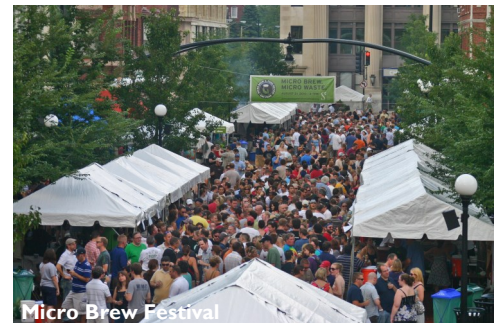
Micro Brew Festival