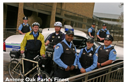
Among Oak Park's Finest