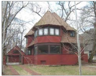
1019 Chicago Ave.