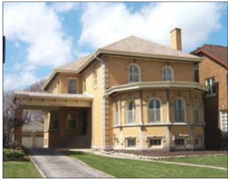
1139 Woodbine Ave.

Of the eight executed bootlegged houses, only six remain. Although some of these remaining structures feature popular architectural styles of the era, as a group they represent Wright's evolving design ideas during the 1890s that would lead to his mature Prairie style of architecture. The Robert Parker House has retained excellent integrity, and its exterior stands virtually unchanged from its 1892 appearance.