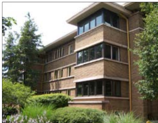
175-181 Linden/643-645 Ontario

July 20, 2009: The Benson/Armstrong House is a two-story brick house at 1139 Woodbine Ave. designed by architect George (Gustav) E. Pearson in 1929 in the Italian Renaissance Revival style. The property is significant for its architecture and for its association with Pearson. The house is located in the