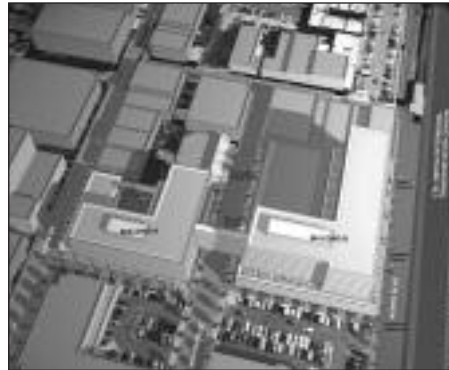
An aerial view of a massing study for the downtown development site.

While the three respondents chosen to advance did not present finished concepts, their approaches were varied and appealing for different reasons. One saw the site as a place for mixed use, with retail on the ground floor and more