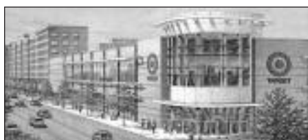
Urban-style Target planned for Chicago.

W ith this issue, the community newsletter OP/FYI returns to its original bi-monthly publication schedule as part of the effort to trim Village operating expenses and take advantage of the growing reliance of citizens on the internet as a source of the most up-to-date news. In addition to this issue, newsletters are scheduled for March, May, July, September and November. The OP/FYI was originally launched in 1989 on a bi-monthly schedule, moving to monthly in 2001. Residents are urged to visit www.oak-park.us/news for breaking news from the Village. Residents also can receive the latest official Village news via e-mail — just go to www.oak-park.us/news and look for the e-news icon to sign up. A new, monthly on-line version of the OP/FYI also is being planned. For more information, call 358.5770 or e-mail village@oak-park.us .