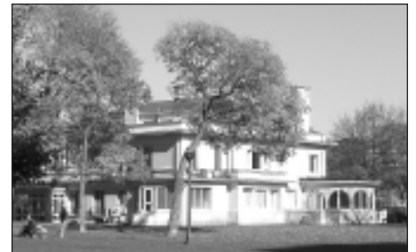
Pleasant Home viewed from Mills Park

New technology at the Oak Park Area Convention and Visitors Bureau is taking self-guided tours of the community's historical sites to an entirely new level. The local Bureau has become one of the country's first to offer visitors hand-held devices that provide a multi-media audio and visual tour in a personal digital assistant (PDA) format. Unlike the wands that offered only sound, the new devices combine a detailed audio tour with current and historical images of Oak Park's buildings, homes and gardens displayed in color on a small screen. The new device also provides an electronic map. Visitors can take the new PDA tour for $9 or for $20 combine the tour with tickets to Frank Lloyd Wright's Unity Temple, Ernest Hemingway Birthplace and Museum, the Oak Park & River Forest Historical Society and Pleasant Home. For more information, call 708.524.7800 or visit www.visitoakpark.com .