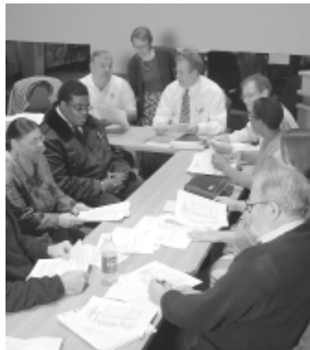
Members of the Citizens Involvement Commission discuss applicants for the Village's more than 25 volunteer boards and commissions.

In the area of economic development, for example, the Plan Commission typically reviews proposals from developers in an open forum designed to allow for maximum input by residents who have an interest in, or will be the most affected by, any new structure. Long established to provide the primary forum for public discussion on