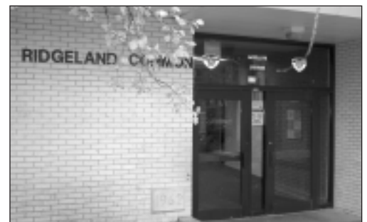
The Police Substation at Ridgeland Common

O ak Park police currently use 10 substations located throughout the Village as part of the Resident Beat Officer program. A new substation is now open near the intersection of Harrison Street and Austin Boulevard and a substation is scheduled to open in January at Dole Library, 255 Augusta Ave. Police substations also are located at 4 Chicago Ave.; the Metra/CTA station, 119 North Blvd.; near Bank One on Marion Street just north of Lake Street; in the Avenue Parking Garage, 710 North Blvd.; in Mills Tower, 1025 Pleasant Place. In the Ryan-Farrell Building, 435 S. Humphrey Ave.; at Ridgeland Common, 415 Lake St.; in the Field Center, 935 Woodbine Ave; and in the Carroll Center, 1125 S. Kenilworth Ave. For more information call 358.5509 or email police@oak-park.us .