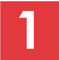
Table Discussion Reports

Meeting attendees gathered in smaller groups to discuss their issues and concerns regarding the Oak Park Greater Downtown Master Plan. One representative from each group then reported back to the larger group the issues raised at their table. Flipchart notes of those comments are as follows.