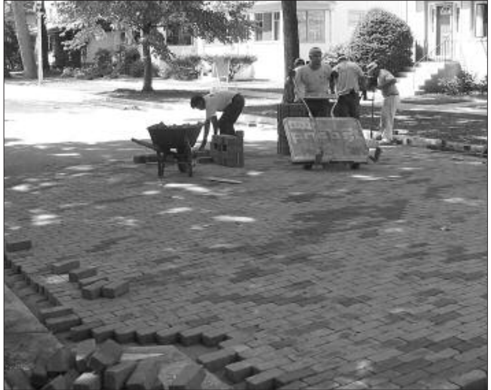
Workers install some of the 150,000 bricks needed to pave two blocks of South Humphrey Avenue.

V illage President David Pope has been named co-chair of the Sustainable Development Task Force for the U.S. Conference of Mayors. The task force will work to create initiatives for building better, more eco-friendly communities across the country. For more information on the task force, call 358.5796 or e-mail board@oak-park.us . Information also is posted at www.usmayors.org .