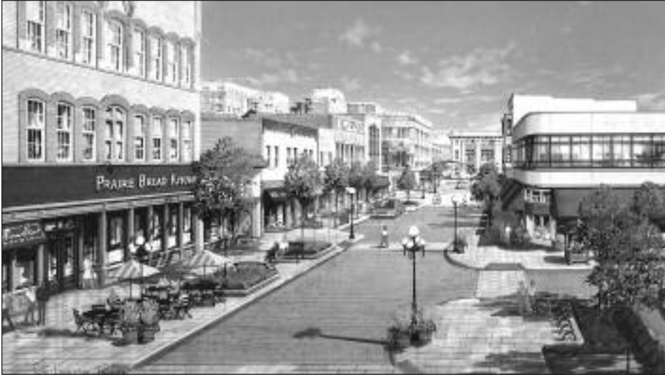
The future view north along Marion Street from North Boulevard. To see this artist's rendition in color, visit www.oak-park.us .