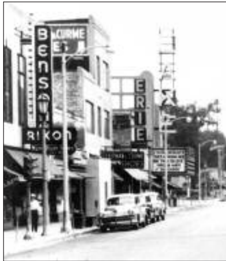
Lake Street east from Marion, 1948.

The Historic Preservation Commission and representatives of the downtown business community have joined forces to discuss how best to balance the need for economic development with preserving the historic character of the Village's central business district. An advisory committee made up of members from the Historic Preservation Commission and downtown property owners has been formed to review the process to date and determine how to proceed, including fostering broader public participation. The need for the new committee grew from the HPC's recent efforts to foster public discussion of various options for preserving the historic and architectural character of downtown Oak Park, which includes the areas south of Ontario Street, north of North Boulevard, east of Harlem Avenue and west of Forest Avenue. Public input will continue to be a key component of the new committee's approach. Announcements of future meetings will be posted at www.oak-park.us and broadcast on VOP-TV6, the Village's cable television station. For more information call 358.5417 or e-mail planning@oak-park.us .