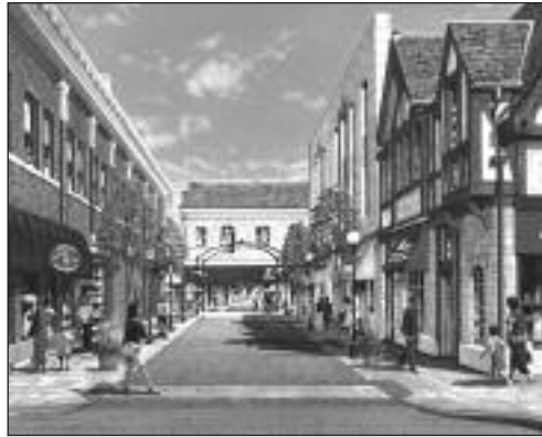
Looking east along Westgate Street. See it in color at www.oak-park.us .

For more information on the Marion Street project, call 358.5648 or e-mail planning@oak-park.us . Information and progress reports also will be posted at www.oak-park.us .