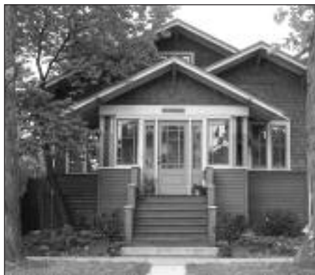
1116 S. Humphrey Avenue

Owners of 14 Oak Park homes and businesses were honored with 2007 Historic Preservation Awards, an annual recognition program sponsored by the Oak Park Historic Preservation Commission. Award winners were selected by a panel of preservation professionals from other communities.